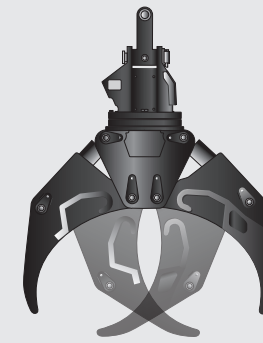
DEVELON Log Grapple