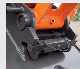
Wedge Lock Quick Coupler