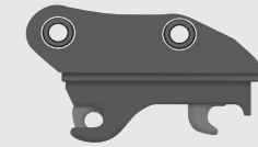
Hydraulic Quick Coupler

Meet your grading and backfill demands with a ditch-cleaning bucket. Features high-quality, abrasion-resistant material for enhanced durability. Utilizes a flat bottom to level ground. Optimized for angle filling and dumping.