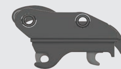
Hydraulic Quick Coupler

Enables cost-effective grading, sloping and land clearing. The bucket rotation has a tilt of 45 degrees in either direction. Universal hydraulic connections attach and detach hydraulics easily. The short tip radius and compact design deliver maximum strength.