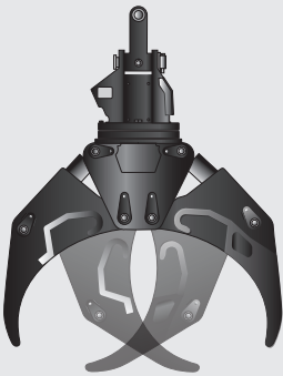
DEVELON Log Grapple