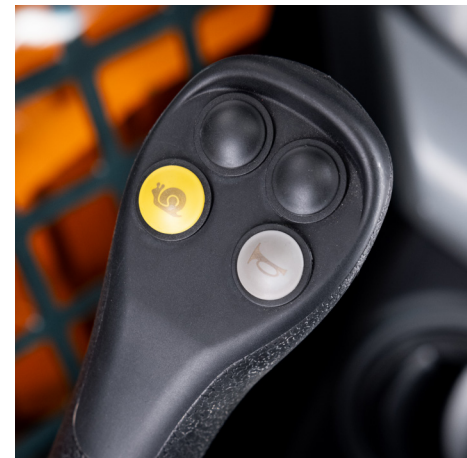
See model specifications for details at na.develon-ce.com/ctl .

With its slow, intentional movements, creep control enhances the compact track loader's maneuverability and precision, affording you better control while operating at high rpms. The feature can be easily activated from the left-hand joystick.