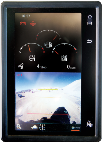
8-inch screen shown.