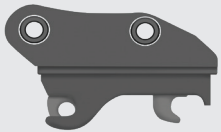
Hydraulic Quick Coupler

Match your grading and backfill demands with ditch cleaning buckets. Features high-quality, abrasion-resistant material for enhanced durability. Utilizes a flat bottom to level ground. Optimized for angle filling and dumping.